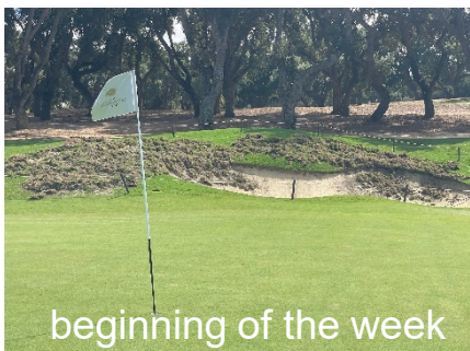
beginning of the week

Despite this, the course team is doing a fantastic job keeping everything in great shape, so we can continue to enjoy our golf.